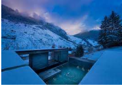
Therme Vals Spa, Switzerland